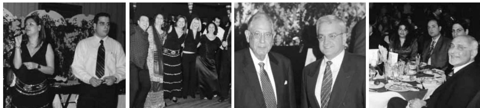
Pictures from the New Year's Eve Party 2005 - see article on next page